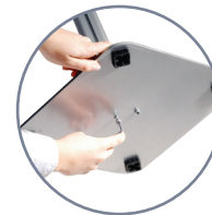
Easy base assembly.