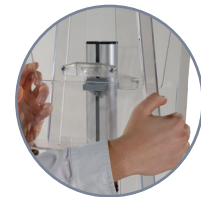
Clip-fit brochure holders.